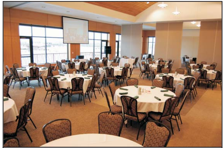
The Ballroom in Munster's Centennial Park.

Further details about the Care to Share Dinners will be available on our website ( www.hospicecalumet.org ) under “Events.” Join us for evenings with a purpose that offer great food and fun and a beautiful view!